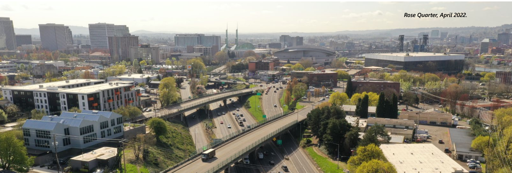
Rose Quarter, April 2022.